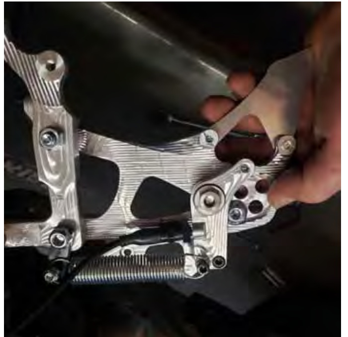
Brake side backend

THIS PRODUCT IS INTENDED TO BE INSTALLED BY A CERTIFIED TECHNICIAN*