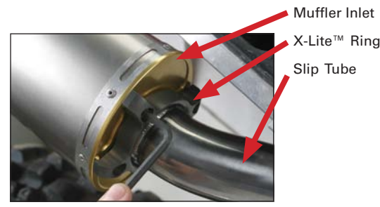
V.A.L.E.™ Assembly Detail